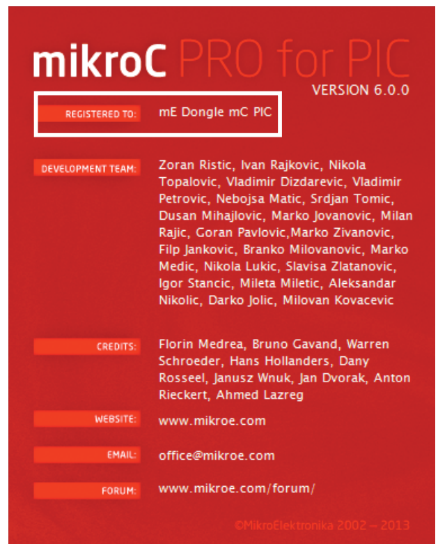
Figure 1-2: mikroC PRO for PIC® About Window