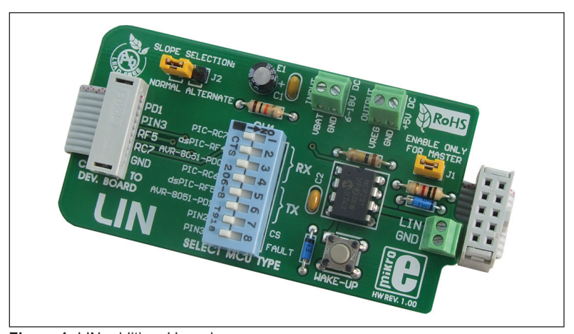
Figure 1: LIN additional board