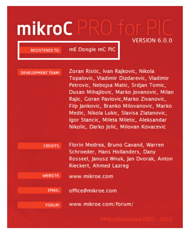
Figure 1-2: mikroC PRO for PIC® About Window