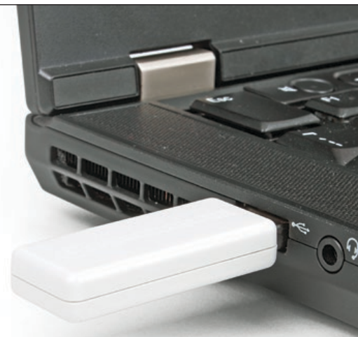
Figure 1-3: USB Dongle plugged into Laptop USB host connector

Unfortunately not. If you lose your dongle you will need to buy a new compiler license and pay the full price.