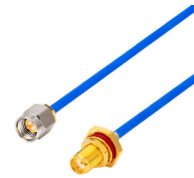
CASE STYLE: KP1567-XX