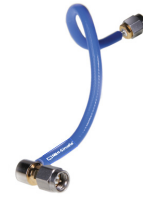
CASE STYLE: KQ1612-XX