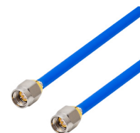
Generic photo used for illustration purposes only