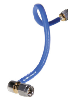
CASE STYLE: KQ1612-XX