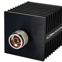
CASE STYLE: LL2798-2