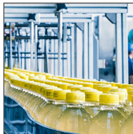
Food and Beverage