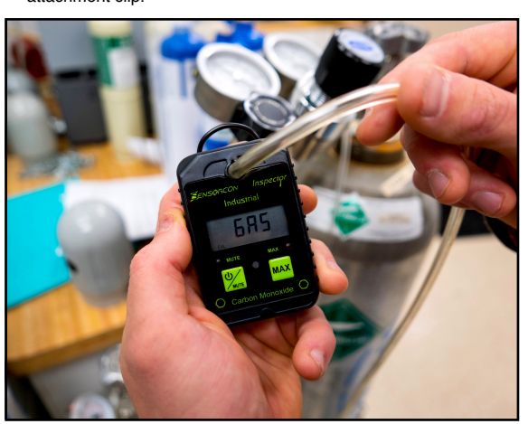
The Inspector is easy to carry and intuitive to use.

The user interface includes a high visibility LCD display with sensible and intuitive operation for ease of use.