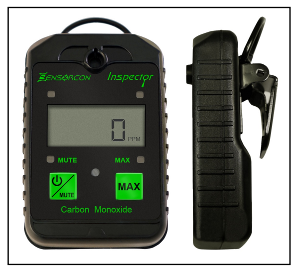
The Inspector features a large LCD readout, positive click buttons, a durable waterproof case, lanyard loop and rugged attachment clip.