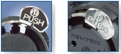
New ergonomic asymmetric locking release tab