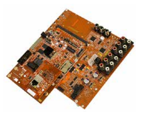
SABRE for Automotive Infotainment Based on i.MX 6 Series