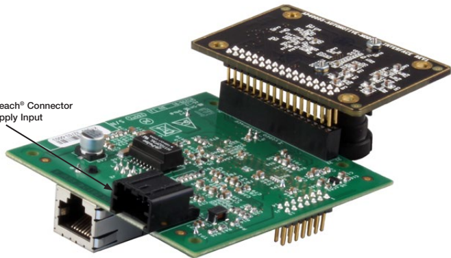
Figure 2: Qorivva MPC5604E Kit (bottom angle)

J3 - BroadR-Reach® Connector with Power Supply Input