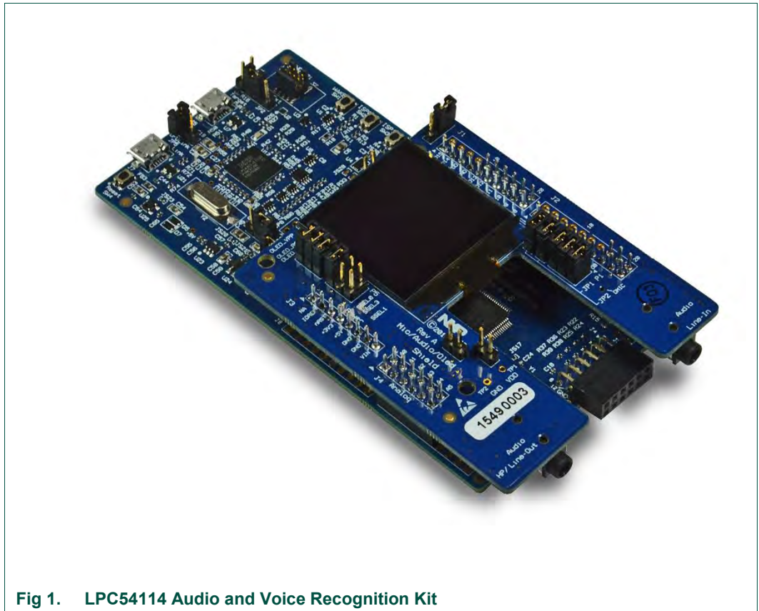
Fig 1. LPC54114 Audio and Voice Recognition Kit

The LPC54114 audio and voice recognition kit (“The Kit”) combines the LPC54114 MCU with an OLED display, digital microphone and audio CODEC in a two board set, complemented by a software framework optimized for always-on sensing applications. The hardware consists of an LPCXpresso54114 board and Shield Board (Mic/Audio/OLED or MAO Shield), developed by NXP for flexibility and ease of use. The Kit can be used with a wide range of development tools, including the LPCXpresso IDE, Keil uVision, and IAR EWARM of NXP.