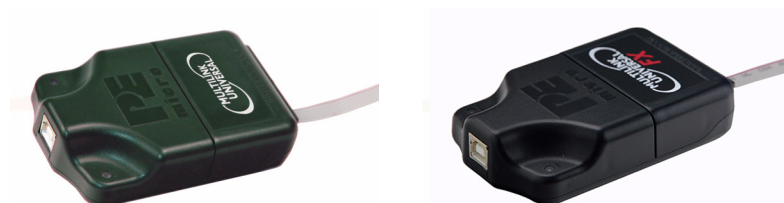
Figure 8-1: Multilink Universal (left) & Multilink Universal FX (right)