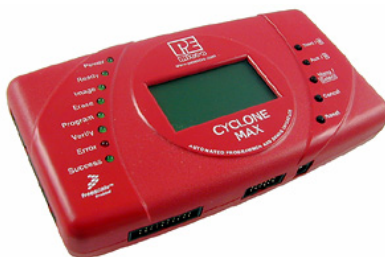
Figure 8-2: P&E's Cyclone MAX