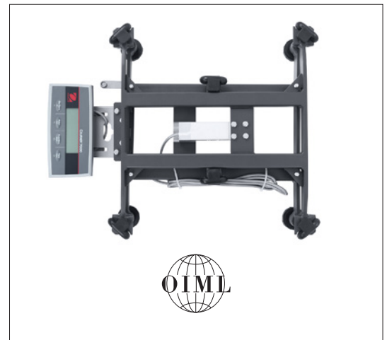
Sturdy powder-coated steel frame holds up to heavy daily shipping use