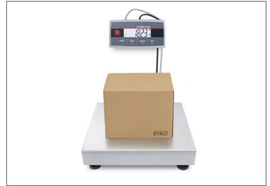
Integrates with shipping system software

The large, bright display clearly shows weights in dimly-lit warehouse and loading dock areas. The indicator comes base mounted but can be attached to a column for display above the platform. A second Remote Display and column can be used to show the results for added verification.