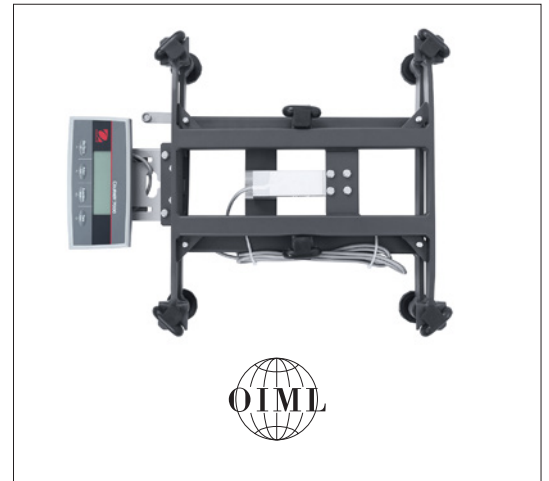
Sturdy powder-coated steel frame holds up to heavy daily shipping use