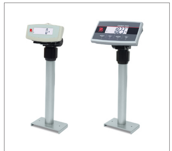
Optional Remote Display on column mount and Column Mount for scale indicator available