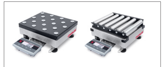
Ball Top and Roller Top Platform Options

Provides simple averaging of weights for unstable loads.