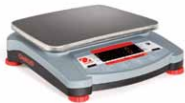
Navigator XT with LED display