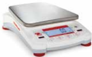
Navigator XL with LCD display