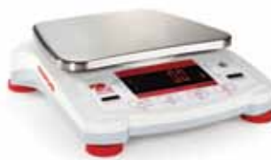
Navigator with square pan and LED display