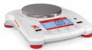
Navigator with round pan and LCD display