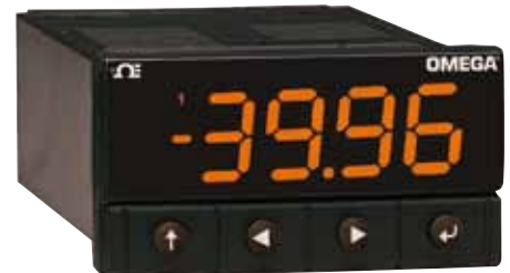
CN32Pt Series shown actual size.