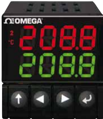
CN16DPt Series shown actual size.