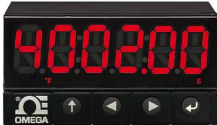
CN8EPt Series shown actual size.