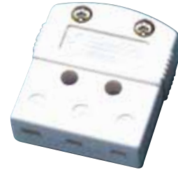
Miniature uncompensated version male and female shown actual size.