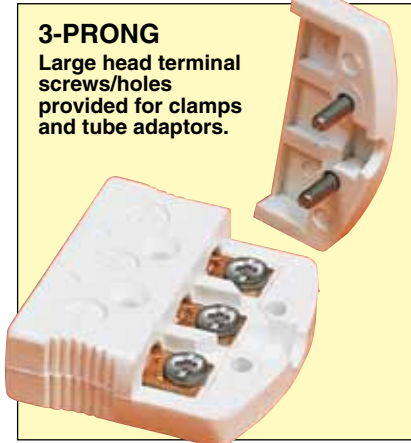
3-PRONG Large head terminal screws/holes provided for clamps and tube adaptors.