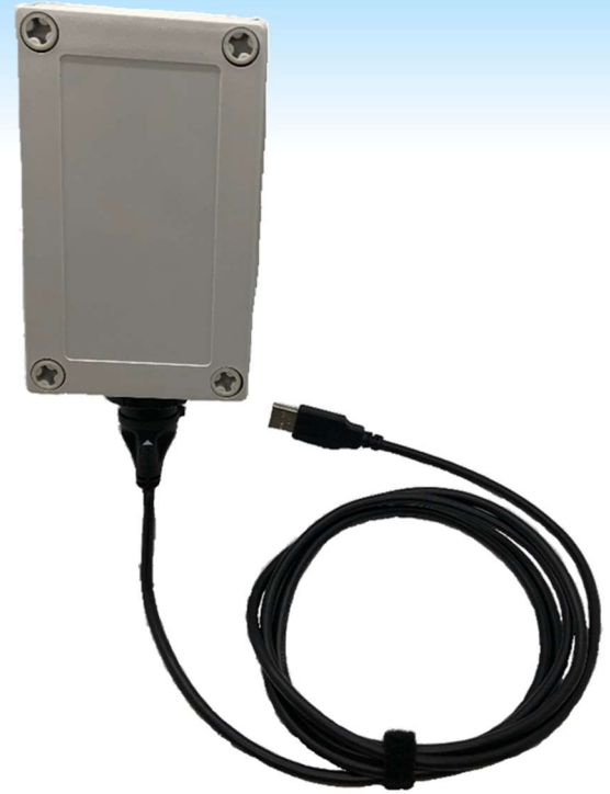
OPS7242 Radar Sensor