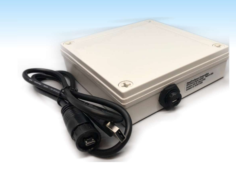
OPS7242 Radar Sensor