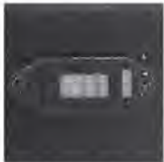
Dual Voltage Selector

ORION FANS fan trays are available in dozens of stock configurations. If you cannot find what you are looking for give us a call. We can design and build your trays from scratch or we can help you come up with solutions for your toughest problems.