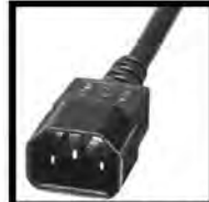
Dual Voltage (IEC320 C14)