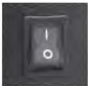
Lighted on/off rocker