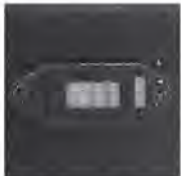
Dual Voltage Selector

L=14" W=19" D=1.75". Optional lighted on/off rocker with IEC320, C14-type connector on back. 115/230 voltage selector included with dual voltage tray.