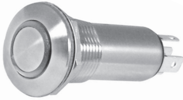
High Profile Curved Button