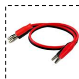
Test Leads (optional)