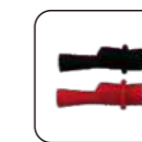
Alligator Clip (optional)