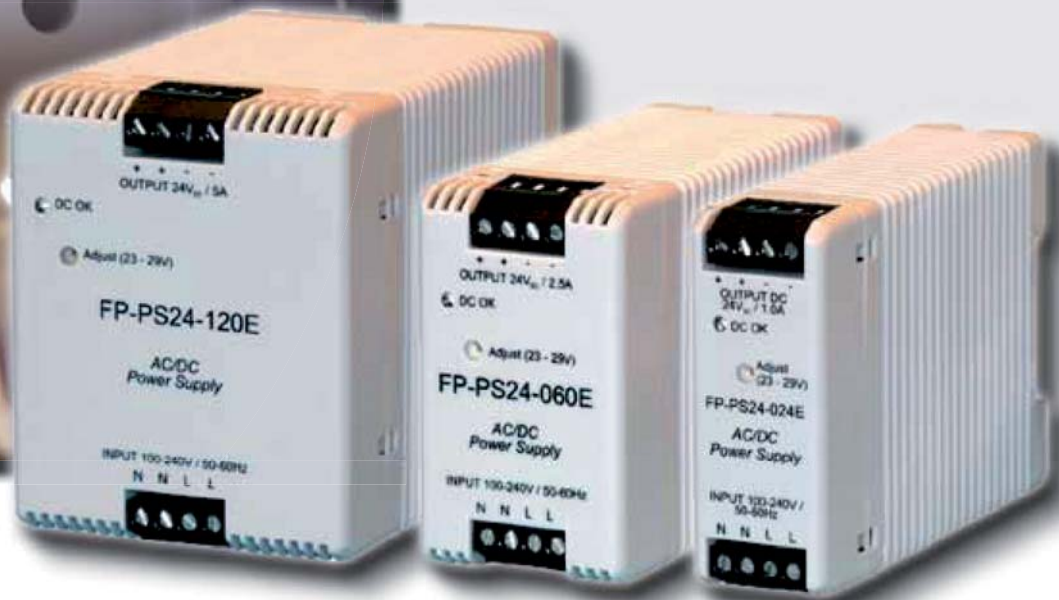
FP-PS24-120E 5.0A/24V DC