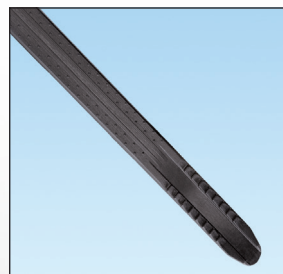
Anti-slip strap body and finger tip grip