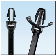
BP, BW designs