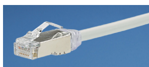
STP28X#M ^ (F/UTP)