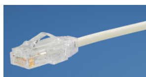
UTP28SP#M ^ (UTP)