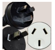
Plug Type I (Australia)