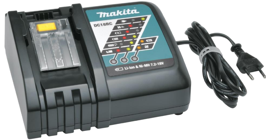
18 VOLT BATTERY CHARGER

See Images Below for an illustration of Plug Types.