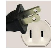
Plug Type A (North America)