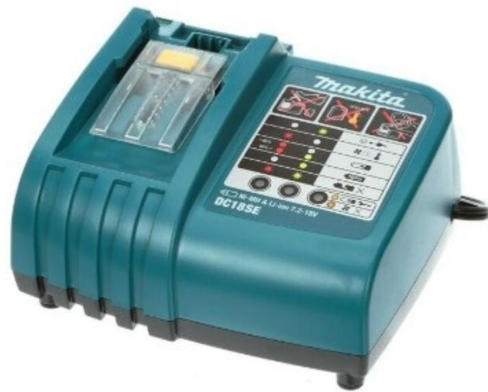
12 VDC AUTO CHARGER SHOWN (120 VAC AND 230VAC UNITS SIMILAR)