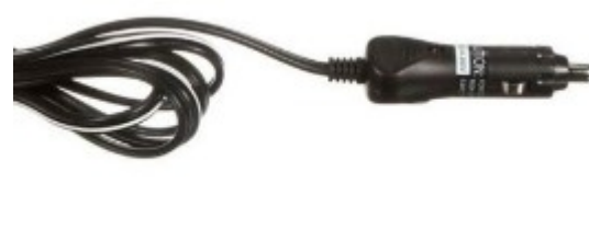
12 VDC AUTO PLUG