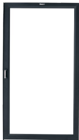
Net-Contain™ Universal Single Row Containment Single Sliding Door