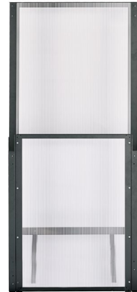
Net-Contain™ Height Adjustable Vertical Wall