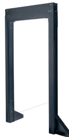
Net-Contain™ Universal Single Row Containment End of Row Frame (2 per System)