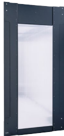
Net-Contain™ Universal Single Row Containment End of Row Cap