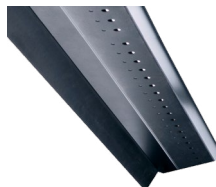
Net-Contain™ Universal Single Row Wall Beam to Wall Seal Kit