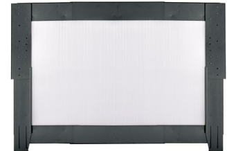
Net-Contain™ Height Adjustable End of Row Vertical Wall