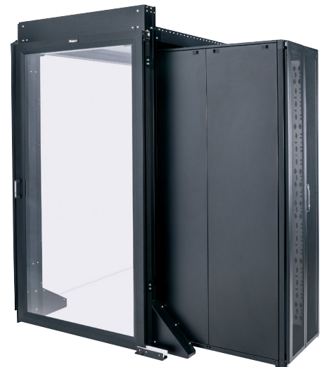
Full System View