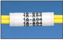
Suggested Label Solutions for TIA/EIA-606-A Compliance