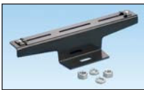
FR12CS12 FR12CS58 FR12CS12M FR12CS58M