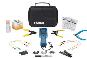
FOCOT2-BKIT (Patch cords available separately or in termination kits)

***Substitute for fiber type: For multimode, insert XAQ for 50/125µm, 5BL for 50/125µm, or 6EI for 62.5/125µm.