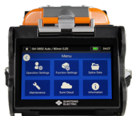
Quantum™ Type-Q102-CA Core Alignment Fusion Splicer