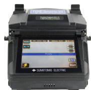
Quantum™ Type-QH201e-VS Handheld Fusion Splicer

Type-Q102-CA-KIT-8RFH: Includes All of KIT-1 Components; Plus FC-8R Hand-Held Automatic Blade Rotation Cleaver with Fiber Holders