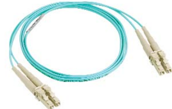
F ^ E10-10M ^ Y

^Substitute for fiber type: Z (OM4 – 10Gig™ 50/125µm), X (OM3 – 10Gig™ 50/125µm), 5 (OM2 – 50/125µm), 6 (OM1 – 62.5/125µm) and 9 (OS1 – 9/125µm). For plenum (OFNP) rated cable, place a P after the fiber type (^) and drop the Y.