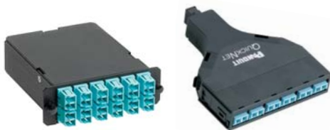
FC ^ -24-10Y