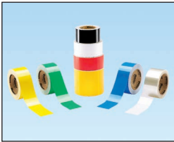
Printable Floor Tape