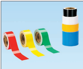
Solid Color Floor Tape