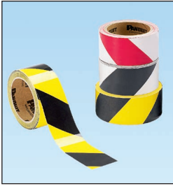
Striped Floor Tape