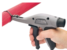
Cable Tie & Tools