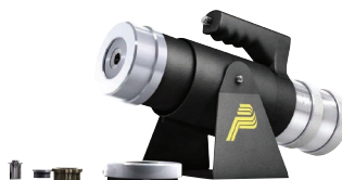
Pico Series 500