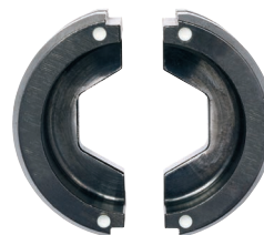
Greenlee Hex Die