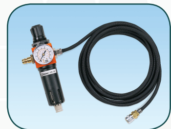
Pneumatic Tool Accessories