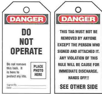
Front PST-3 Back