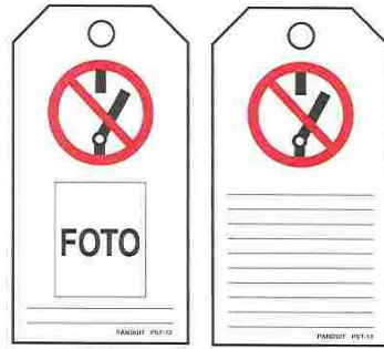
Front PST-12 Back