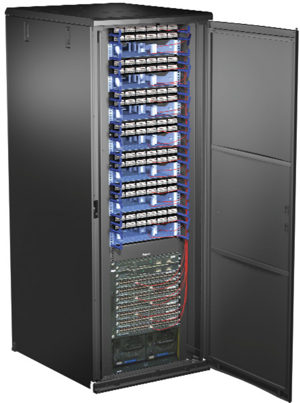
Figure 2: Application of a horizontal slack manager and bend radius posts installed in a full size cabinet

Dimensions are in inches [Dimensions in brackets are in millimeters]