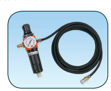
Pneumatic Tool Accessories

Visit www.panduit.com for our complete line of pneumatic tool accessories