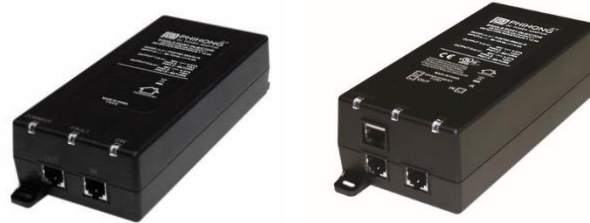
Shown here in standard on the left and with NIC option on the right