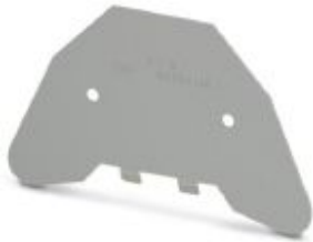
Partition plate, width: 0.5 mm, color: gray

Please be informed that the data shown in this PDF Document is generated from our Online Catalog. Please find the complete data in the user's documentation. Our General Terms of Use for Downloads are valid ( http://phoenixcontact.com/download )