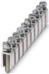
Fixed bridge, pitch: 6.2 mm, number of positions: 10, color: silver

Please be informed that the data shown in this PDF Document is generated from our Online Catalog. Please find the complete data in the user's documentation. Our General Terms of Use for Downloads are valid ( http://phoenixcontact.com/download )