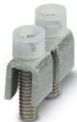
Fixed bridge, pitch: 15 mm, number of positions: 2, color: silver

Please be informed that the data shown in this PDF Document is generated from our Online Catalog. Please find the complete data in the user's documentation. Our General Terms of Use for Downloads are valid ( http://phoenixcontact.com/download )